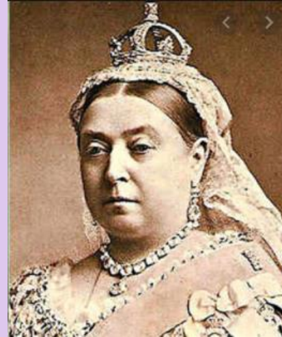
This is Queen Victoria. She used to be the Queen of England.

Football was popular, but as a ball was expensive you had to play with whatever you could get your hands on! These boys are playing with a kettle!