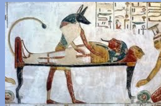
Ancient Egyptian Tomb Painting