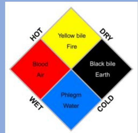
Theory of the Four Humours